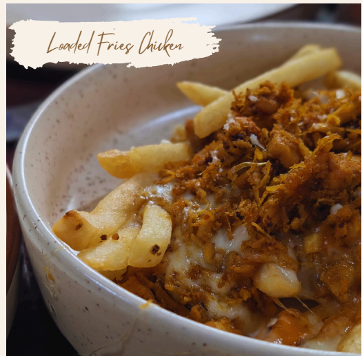
Loaded Fries Chicken